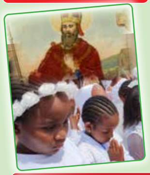
Week Saint Patrick

Repeat daily"Lord I come to do your will"